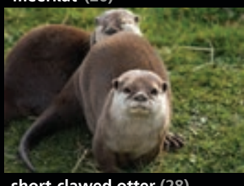
short-clawed otter (28)