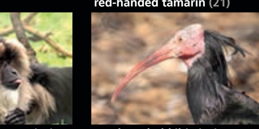
northern bald ibis (35)