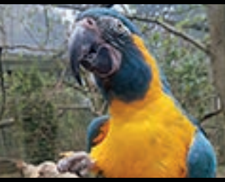
blue-throated macaw (42)